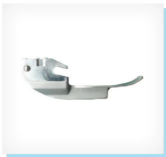
Optional blade sizes available are: Miller 0

The ClearVue™ VL3R comes standard with size 2, 3, and 4 reusable Mac blades.