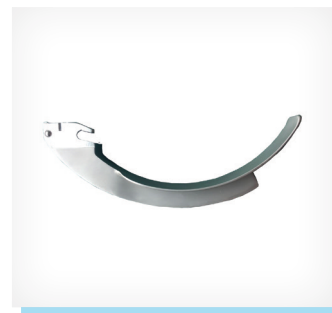
and Mac 5.