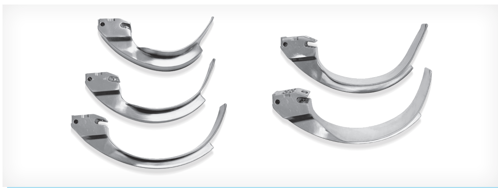
Optional Curved Mac "D" Blades Sizes 1,2,3,4,5